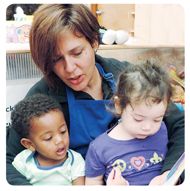
Thousands of Alameda County children are on waiting lists for subsidized child care and early education.

Thousands arrive NOT ready for kindergarten. Fifty-six percent (56%) of Alameda County children are not fully prepared to start kindergarten when they arrive, and 20% of those are not even partially ready.