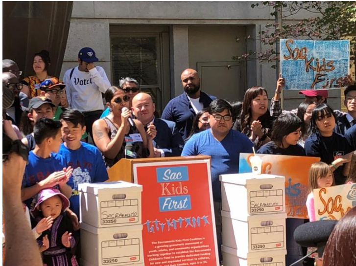
SAC KIDS PREPARING TO DELIVER PETITIONS A Major Victory for Grassroots Organizing

SacKidsFirst submitted 38,000 signatures on April 18 to the City Clerk to place a measure on the ballot requiring the city of Sacramento to put 2.5% of its unrestricted funds into children and youth services. This is how both the San Francisco and Oakland children's funds were created. In Sacramento, this will initially be about $12 Million a year. A coalition of over 22 youth organizations is supporting the measure. The East Bay Asian Youth Center and Youth Forward led the charge!